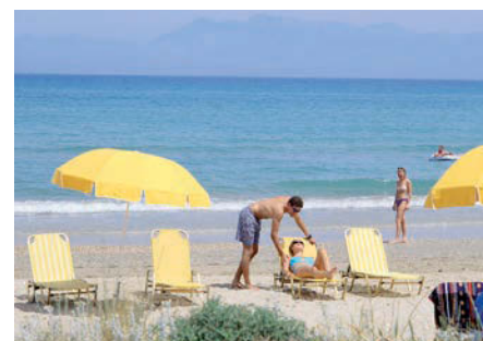
Beach at St George's Bay

Air Conditioning Swimming Pools Free WiFi Spa facilities