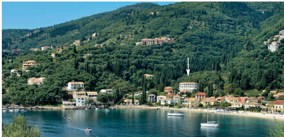
Kalami and location of Kalami Bay

Due to the hillside location and a number of steps in the property we would not recommend Kalami Bay to anyone with mobility difficulties.